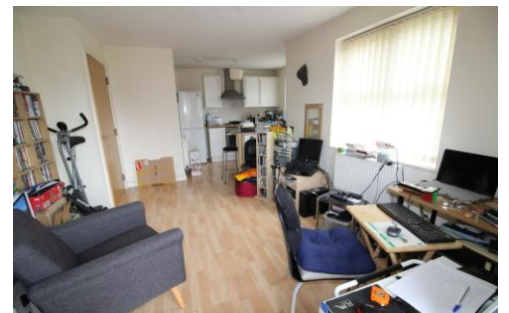
Grand Union House, Ratcliffe Road Loughborough, LE11 1LH