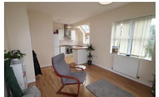
Grand Union House, Ratcliffe Road Loughborough, LE11 1LH